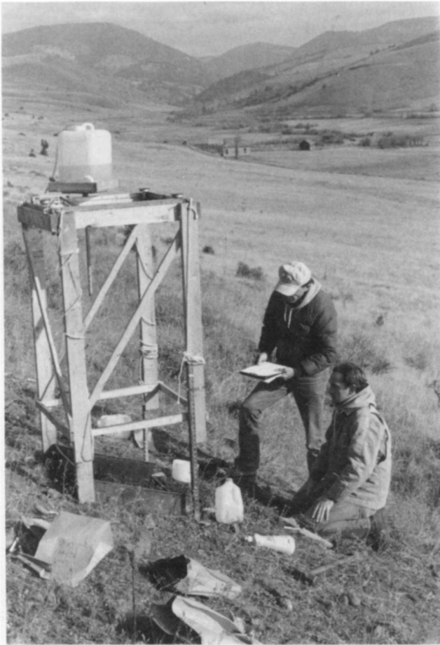
Figure 1. A modified rainfall simulator was used to apply rainfall. The simulator was elevated on a 1.5-m stand to achieve sufficient raindrop impact.

ground covered by litter and rock ( >0.32 cm diam) were estimated visually on each plot. A clinometer was used to determine percent slope of each plot. Soil moisture at 0- to 2.5-cm depth was determined gravimetrically from areas adjacent to each plot.